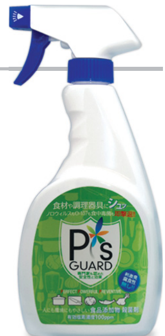
P's GUARD for FOOD (food additives/disinfectant)